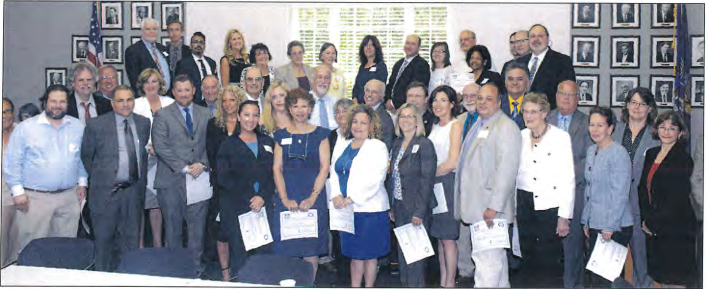
It was a day to celebrate volunteer attorneys who are committed to helping those who need legal help but can't afford it.