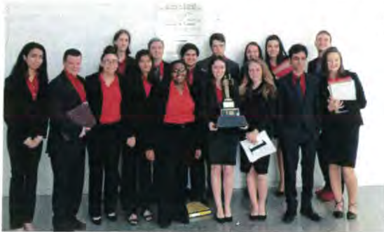
A team from Bay Shore High School won this year's Suffolk County Mock Trial Tournament and will compete in the state finals in Albany.