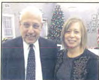
SCBA happenings.....17, 18