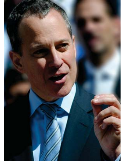
Eric T. Schneiderman Attorney General