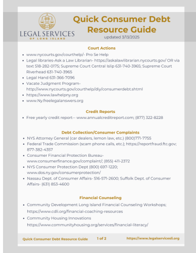
Quick Consumer Resource Guide