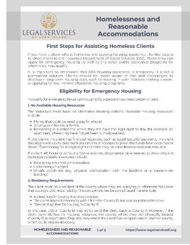
Homelessness and Reasonable Accommodations Guide